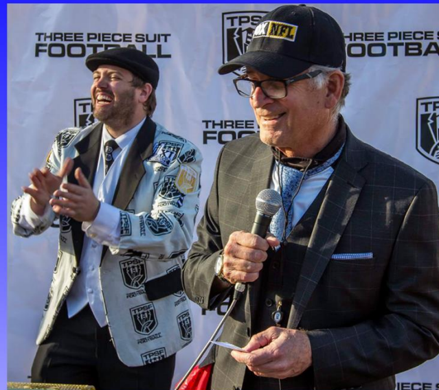
Three Piece Suit Football Atlanta 2019