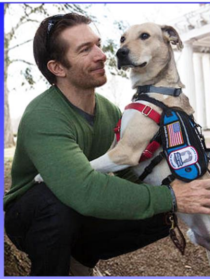
TPSF Atlanta 2019

TPSF members honor an Operation Delta Dog Veteran/Dog graduate at halftime of TPSF Boston.