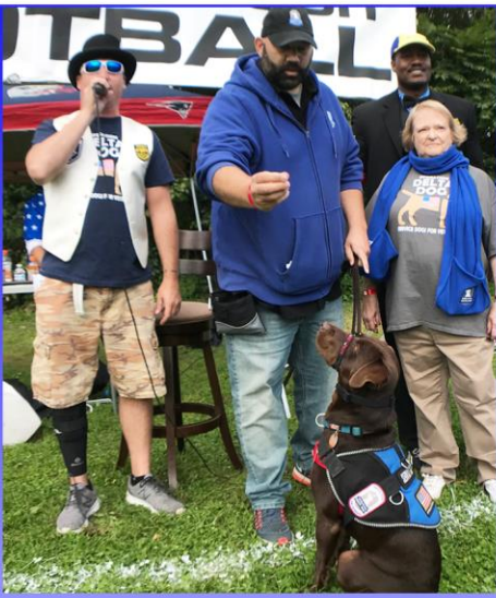
TPSF Boston 2018

TPSF members honor an Operation Delta Dog Veteran/Dog graduate at halftime of TPSF Boston.